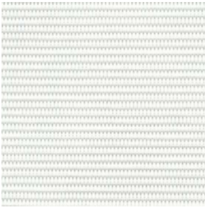
3N 151 White