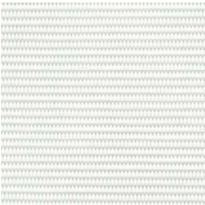
3N 151 White