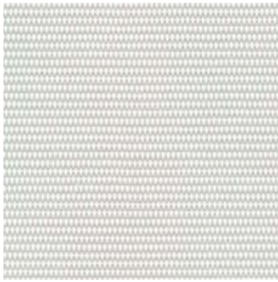
3N 152 Beige