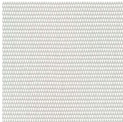
3N 152 Beige