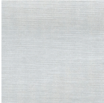
IN 7452 light grey