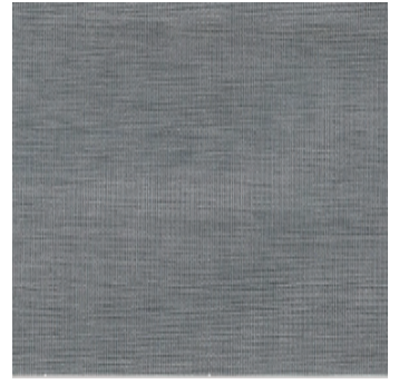
IN 7454 Charcoa