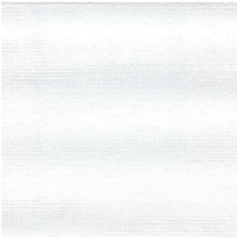
IN 7451 white