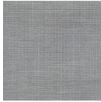
IN 7453 Grey