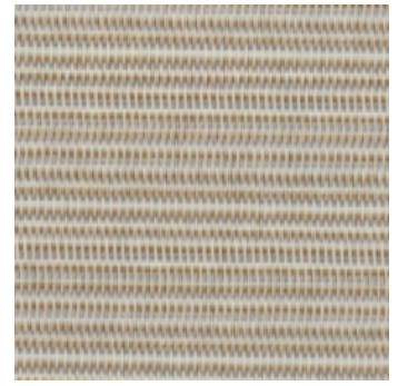
SD 0614 KHAKI