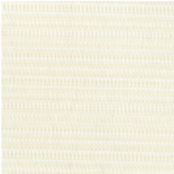
SD 0611 LVORY