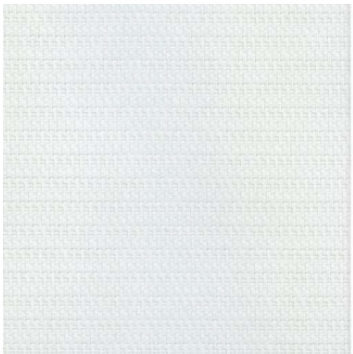
SD 0615 White