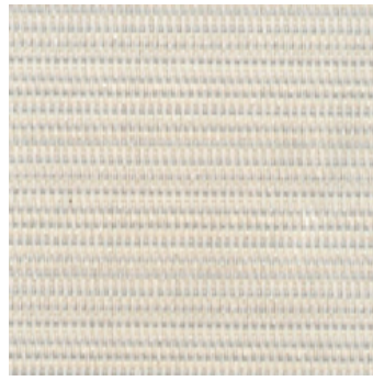
SD 0612 GOLD