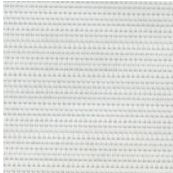
SD 0613 GREY